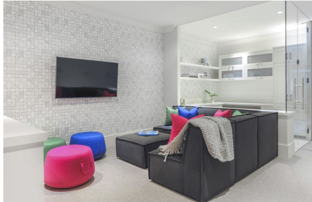
The wallpaper featured in the basement office is carried into the adjacent playroom. It's a pattern that works for both spaces. The glass walls allow the parents to keep an eye on their children.