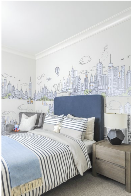
The walls in this toddler's room are covered with custom decals from Urban Walls. The images include all his favourite things, such as diggers and trucks. The yellow, blue, and green accents were added.