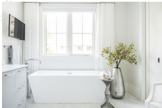
The master bathroom continues the home's predominantly pale colour scheme with grey accents.