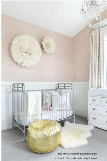
Soft pink grasscloth wallpaper gives texture to the walls in the baby's room.